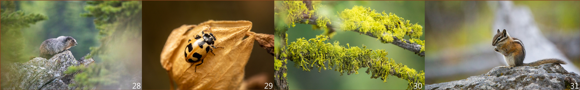
1. Hummingbird clearwing, 2. Mourning cloak, 3. Long beach fern, 4. Eastern kingbird, 5. Western rattlesnake plantain, 6. Apple curculio, 7. Brittle pricklypear, 8. Glaucous gentian, 9. Clustered broomrape, 10. Common gaillardia, 11. Bullock's oriole, 12. Red-femured milkweed borer, 13. Silvery blue, 14. Elegant sunburst lichen, 15. Choke cherry, 16. Fee's lip fern, 17. Four-spurred assassin bug, 18. Sagebrush mariposa lily, 19. Banded garden spider, 20. Ponderosa pine, 21. Common mullein, 22. Cedar waxwing, 23. Rubber rabbitbrush, 24. Showy milkweed, 25. Spotted spreadwing, 26. Anise swallowtail, 27. Crested wheatgrass, 28. Hoary marmot, 29. Parenthesis lady beetle, 30. Brown-eyed wolf lichen, 31. Yellow-pine chipmunk